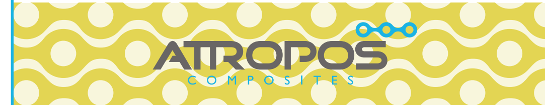
DON'T PUT ON A BUSY BACKGROUND