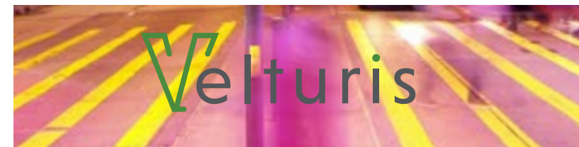
DON'T PUT ON A BUSY BACKGROUND