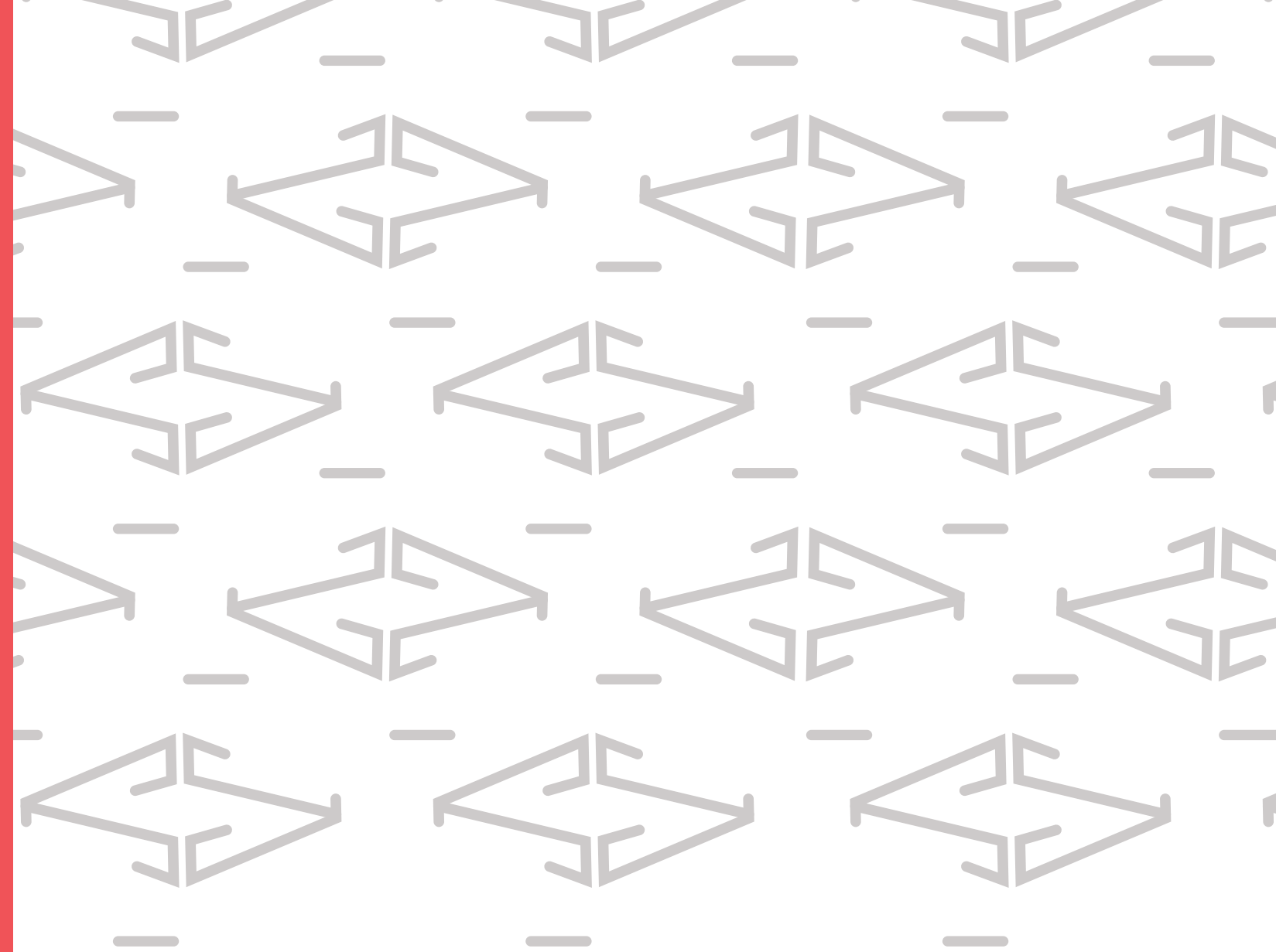
LOGO BACKGROUND PATTERN - ONLY USE WHEN AT LEAST THIS LARGE